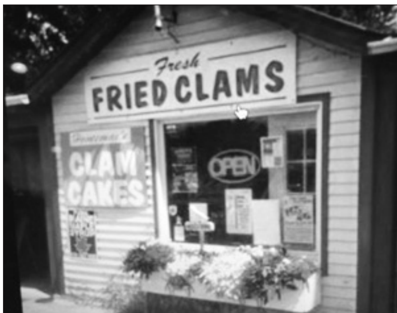
Lost Gull opened April 11th with a remodeled and expanded seating area and new rest rooms.