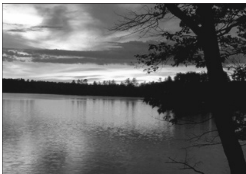
Just another beautiful sunset on Tripp Lake.