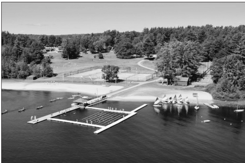
Tripp Lake Camp today.

“The town is well supplied with ponds: in the southerly part are the three Range Ponds (commonly pronounced ‘Rang.’) In the westerly portion we find Thompson and Tripp Ponds. Tripp took its name from one Richard Tripp who first settled near its southern extremity. It's a most beautiful sheet of water of no great depth, surrounded by fine, highly cultivated farms. Near its western terminus is a large meadow, between which and the shore is a large embankment nearly a mile in length, 10 to 12 feet in breadth, with an average height of six feet. No person has the least positive knowledge of its origin or purpose; it must have existed for ages as the remains of gigantic trees which had grown on its summit, long since gone to decay, are still plainly visible.” (Could this be the Tripp Lake Camp land?)