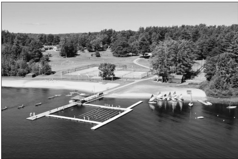
Tripp Lake Camp today.

“The town is well supplied with ponds: in the southerly part are the three Range Ponds (commonly pronounced ‘Rang.’) In the westerly portion we find Thompson and Tripp Ponds. Tripp took its name from one Richard Tripp who first settled near its southern extremity. It's a most beautiful sheet of water of no great depth, surrounded by fine, highly cultivated farms. Near its western terminus is a large meadow, between which and the shore is a large embankment nearly a mile in length, 10 to 12 feet in breadth, with an average height of six feet. No person has the least positive knowledge of its origin or purpose; it must have existed for ages as the remains of gigantic trees which had grown on its summit, long since gone to decay, are still plainly visible.” (Could this be the Tripp Lake Camp land?)